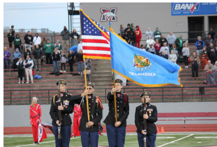
(Above: Senior Color Guard presenting colors at Homecoming)

Even though we have had many events already, it would not be a very good school year if we had nothing to do. Upcoming is Mustang Creek Elementary School Carnival, Veterans Day Color Guard, Home Game; Honor Guard, Push-up Board, and Security, and much much more. With all these events The Battalion staff asks that anyone that can help out so we can continue to do these events