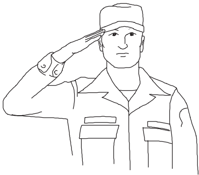
Figure 1.8.1: Hand salute wearing headgear with a visor.

uncovered – to remove a hat or other headgear; to be bare-headed or without a cover.