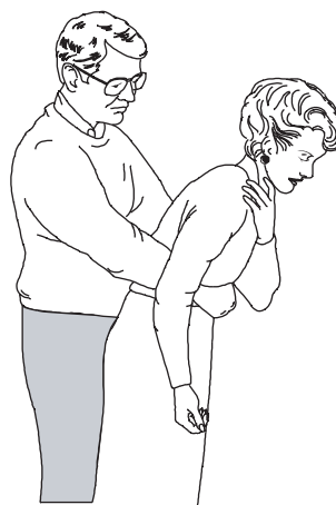
Figure 2.2.1: The Heimlich maneuver can save the life of a choking victim.

Heimlich maneuver – an upward push to the abdomen given to clear the airway of a person with a complete airway obstruction; procedure used to expel an object lodged in the airway of a choking victim.