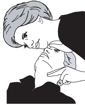
Figure 2.2.5: After two breaths, check for a pulse as you check for breath sounds.

of mouth-to-mouth resuscitation and a procedure known as closed chest heart massage. Mouth-to-mouth resuscitation supplies oxygen to the lungs, while the closed chest heart massage manually pumps blood through the victim's body, circulating it to the heart and brain. These actions help keep the heart and brain alive until the heartbeat is restored or medical help arrives.